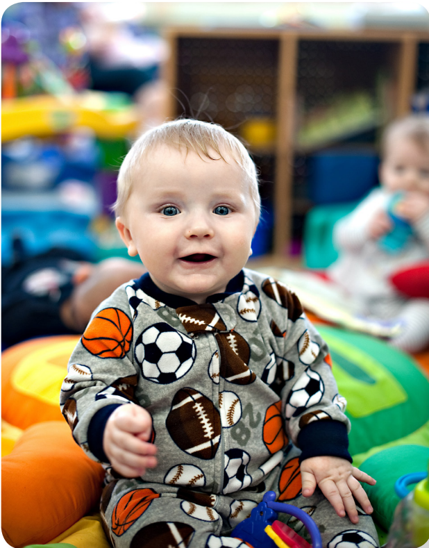
Child of student, Louise Dean Centre

Distribution of Last Resort Fund 2015 Total Funds Dispersed: $12,727.08