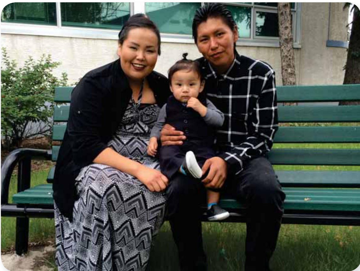
Graduates of the Fathers Moving Forward Program – June 2016

After all, the easiest and least expensive problem to solve is the one we've kept from occurring in the first place.