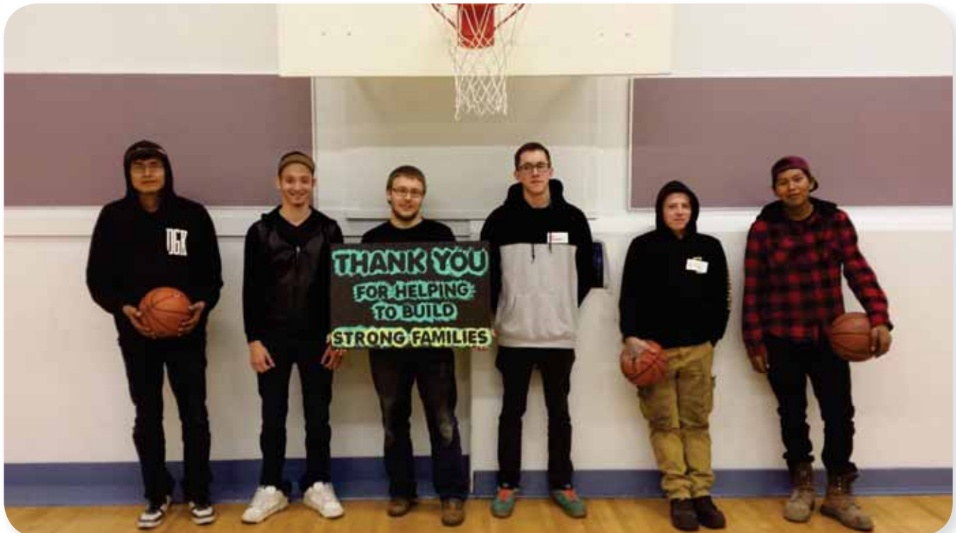
Celebrating “Being a Dad” Graduation – June 2016

We’ve expanded our thinking about wrap-around to intentionally include young fathers – and you’ve been behind us all the way! We got the ball rolling this year with 12 young fathers who enthusiastically participated in programming, walking their talk about how much they want to be a part of their children’s lives.