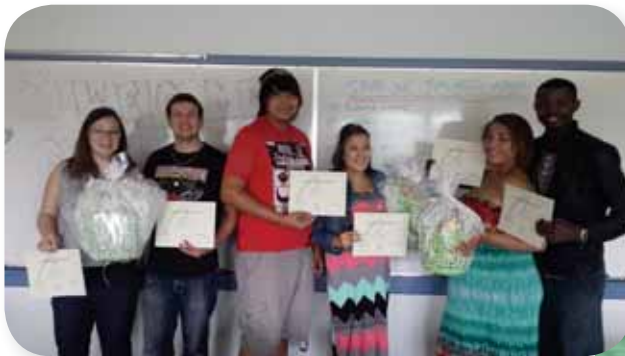
Co-Parenting Graduation – May 2016

For more on the research behind positive father involvement, visit our partner Shift: The Project to End Domestic Violence at www.preventdomesticviolence.ca