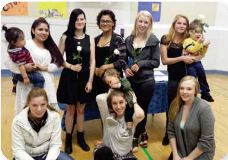
New Graduates of Youth Fair Gains – May 2016

Youth Fair Gains is one example of combining strategies for success. Young parents receive financial literacy training (basic living skill), are encouraged to save monthly, and have their savings matched 4:1 (financial support). They learn how emotions affect spending (mental health). When they complete the program, young parents can withdraw their savings to purchase an approved asset, like post-secondary tuition, work equipment, or an RESP for their babies (future sustainable livelihood).