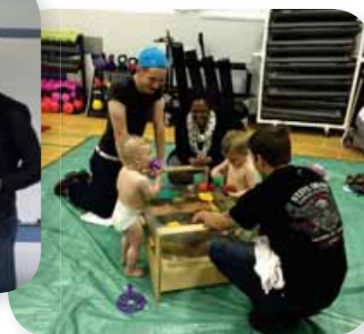
Dads and Kids Play Night – June 2016

"Dads and Kids Play Night was the first time I ever got to take my son somewhere alone. I feel more like a dad." – Participant father